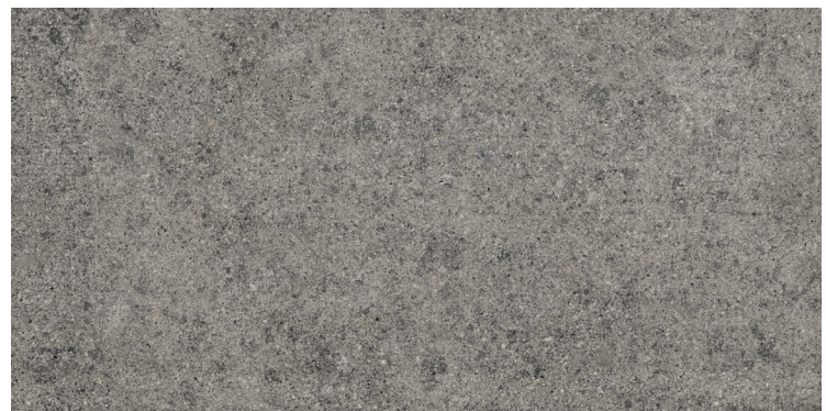
CTTRPOR12241P PORTLAND 12" x 24"