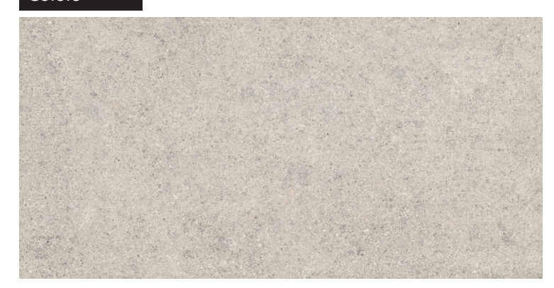
CTTRSEA12241P SEATTLE 12" x 24"